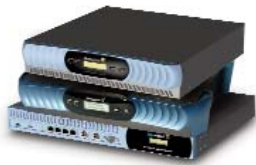
BlueSecure 600 Controller BlueSecure 1200 Controller BlueSecure 2200 Controller BlueSecure 3200 Controller BlueSecure 5200 Controller